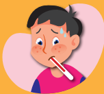
High grade fever