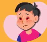
Red watery eyes

Visit your nearest BMC Health Centre/ Dispensary/Hospital in case of any Measles symptoms.