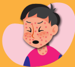
Rashes on Body