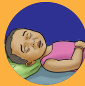
Lethargic or with no movement