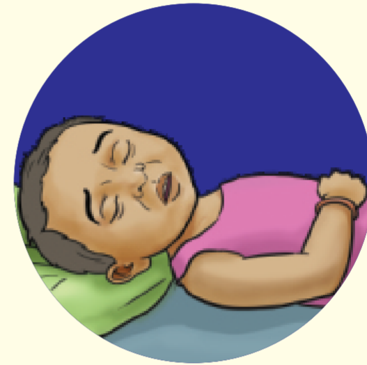
Lethargic or with no movements