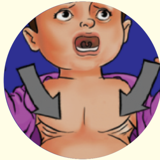
Chest indrawing while breathing